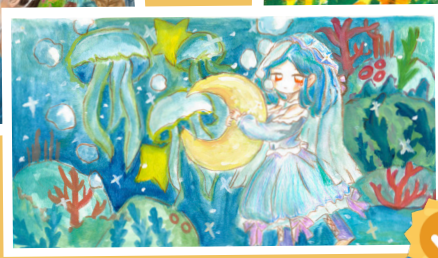
《童心游世界筆袋設計比賽》冠軍 1C 許詩琳