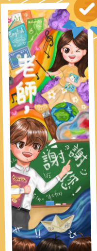
向老師致敬 2022 書籤設計比賽 優異獎 3D 鄧潔心