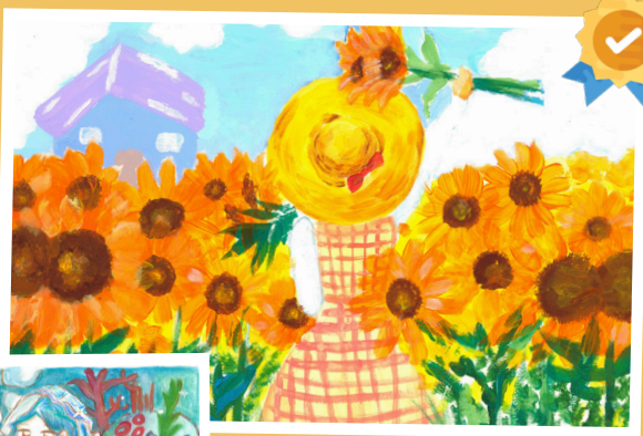
第十二屆世界兒童繪畫大獎賽 少年組 銀獎 1C 鄧鎧雯