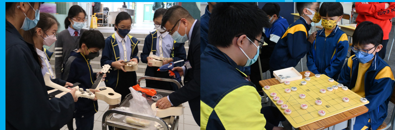
為區內外小學友校提供文藝交流機會