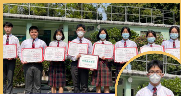
秋知樹渝港澳青少年 尋找原鄉古樹活動古樹名木講解大賽