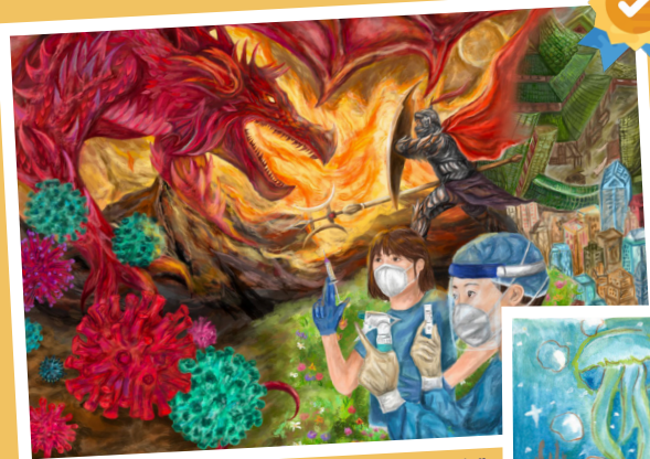
《徐悲鴻盃國際青少年兒童美術比賽》 香港區賽事 初中組 二等獎 3D 鄧潔心