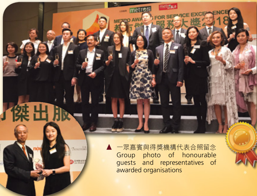
▲ 一眾嘉賓與得獎機構代表合照留念 Group photo of honourable guests and representatives of awarded organisations