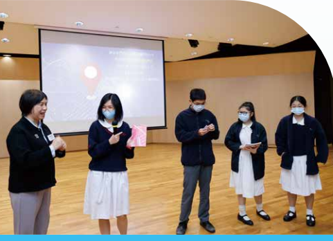
學生拿出有關數據空間的資料,踴躍地參與 有獎問答環節。 Students took out props related to spatial data and joined the pop quiz session swiftly.