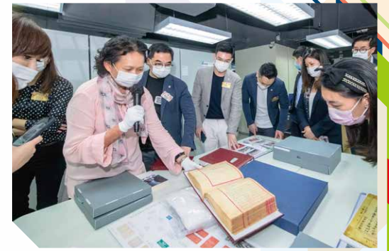
東華三院何超蓮檔案及文物中心 TWGHs Maisy Ho Archives and Relics Centre