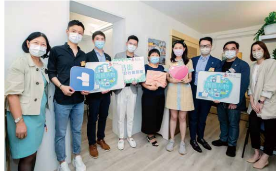
東華三院煮餸易生產中心 TWGHs CookEasy Production Centre