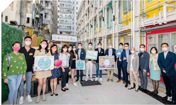
東華三院深水埗南昌街組合 社會房屋「南昌220」 TWGHs Shamshuipo Nam Cheong Street Modular Social Housing "Nam Cheong 220"