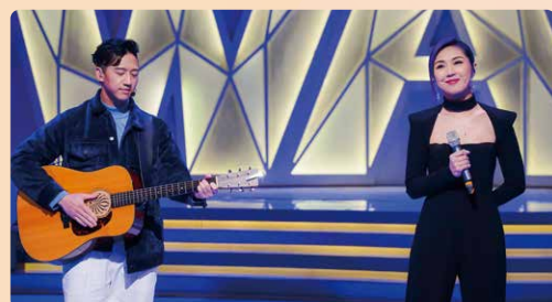
一眾演藝紅星與粵劇名伶為晚會落力演出，為本院籌募經費。 Singers, artists and Cantonese opera masters gave superb performances on that evening to raise funds for TWGHs services.

行政長官林鄭月娥大紫荊勳賢GBS為節目拍攝賀辭，祝願本院繼續將善業發揚光大。 The Hon. Mrs. LAM CHENG Yuet Ngor, Carrie, GBM, GBS, the Chief Executive of HKSAR, wished TWGHs to further develop its philanthropic work for the years to come in her congratulatory video.