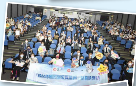
「2022年國家安全齊參與」計劃 "2022 Let's Join Hands in Safeguarding National Security" Programme