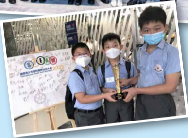
國際青少年創科奧林匹克大賽2022 International Youth Tech Olympics 2022