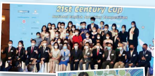
「21世紀杯」全國英語演講比賽(香港賽區) The "21st Century Cup" National English Speaking Competition (Hong Kong)