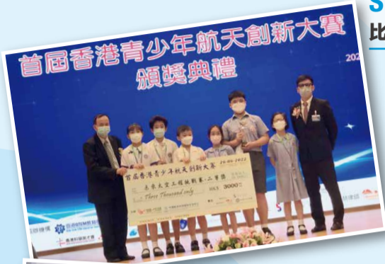
首屆香港青少年航天創新大賽 The 1st Hong Kong Youth Space Innovation Competition