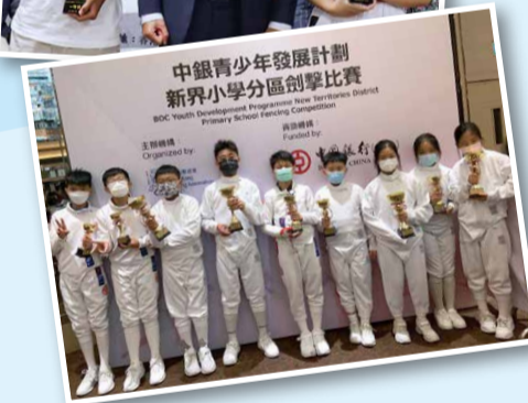
中銀青少年發展計劃新界小學分區劍擊比賽 BOC Youth Development Programme New Territories District Primary School Fencing Competition